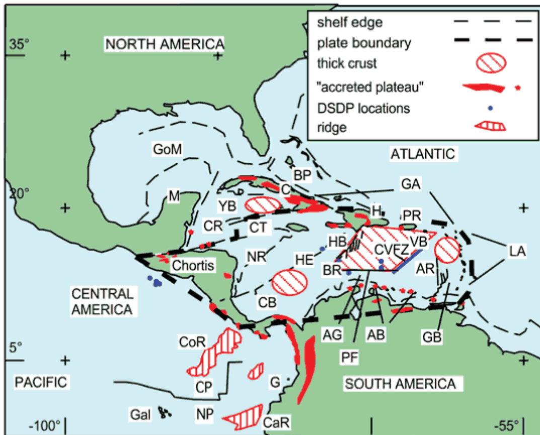
Figure 1. Middle America, AB – Aruba-Blanquilla, AR - Aves Ridge, BR - Beata Ridge, C – Cuba, CB – Colombia Basin, CP – Cocos plate, CR – Cayman Ridge, CT – Cayman Trough, G – Gorgona Island, GA – Greater Antilles, Gal – Galapagos Islands, GB – Grenada Basin, GoM – Gulf of Mexico, HE – Hess Escarpment, LA – Lesser Antilles, M – Maya, NP – Nazca plate, NR – Nicaragua Rise, VB – Venezuela Basin, YB – Yucatán Basin. Locations of Mesozoic plateau rocks in red (after Donnelly et al., 1990). The “original” Caribbean plateau (rhomboid area) lies in the western Venezuela Basin, centred on the Beata Ridge and bounded to the SE by the Central Venezuelan FZ (blue). Accreted elements distributed around the area are commonly attributed to the plateau, though many clearly lie on different plates. Thick crust also occurs in the Yucatán and Grenada basins.

Caribbean geology, distributed over many different countries and islands, appears to be complex. Documentation ranges from good, in highly explored, contiguous areas in northern South America, to poor or absent in remote areas of tropical vegetation cover and weathering. There are no recognised oceanic spreading anomalies or fractures to indicate the age or tectonic origin of Caribbean plate crust. The only spreading ridge in the whole of Middle America lies in the centre of the Cayman Trough, which is a large, plate-boundary pull-apart.